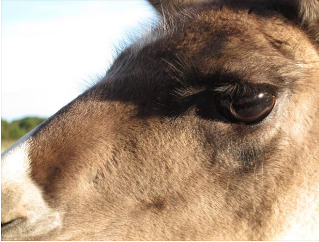
Llama's eye