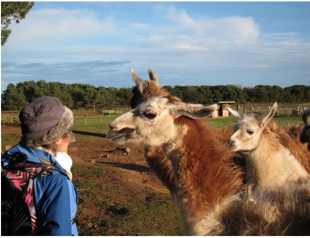
Llamas in East Links Family Play Park awaiting feeding