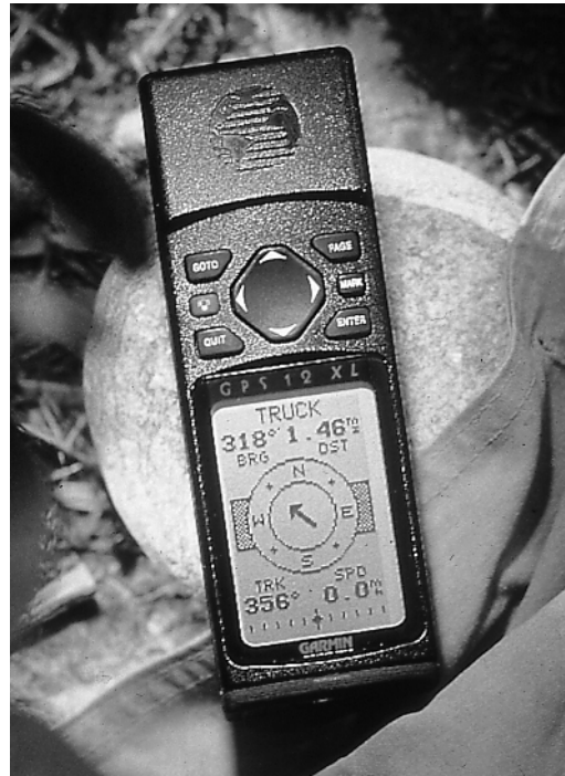
Fig 1. A hand-held 12-channel GPS receiver.

The user segment is comprised of all of the users making observations with GPS receivers. The civilian GPS user community has increased