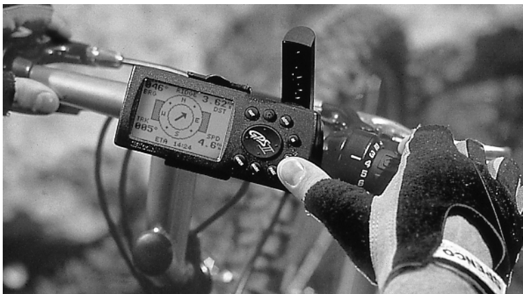
Fig 2. Off-road navigation using GPS.

dramatically in recent years, because of the emergence of low-cost portable GPS receivers (Figure 1 and Plate 23) and the ever-expanding areas of applications in which GPS has been found to be useful. Such applications include surveying, mapping, agriculture, navigation, and vehicle tracking (Figure 2; Plate 24). The civilian users of GPS greatly outnumber the military users.