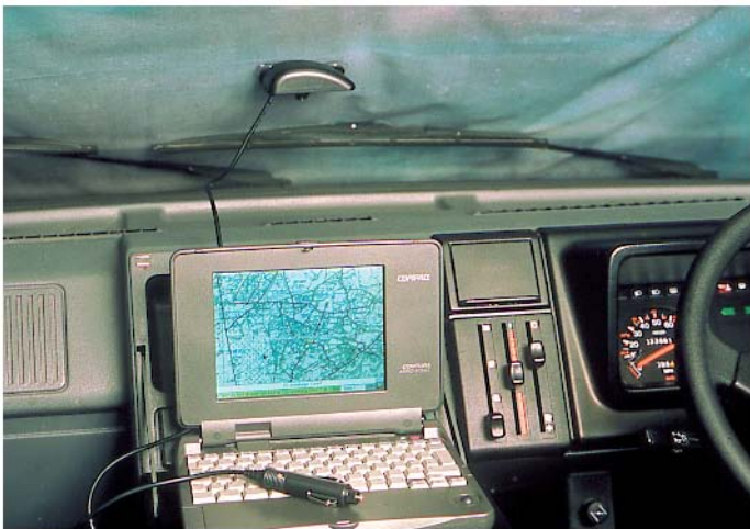
Plate 24 In-vehicle use of GPS.