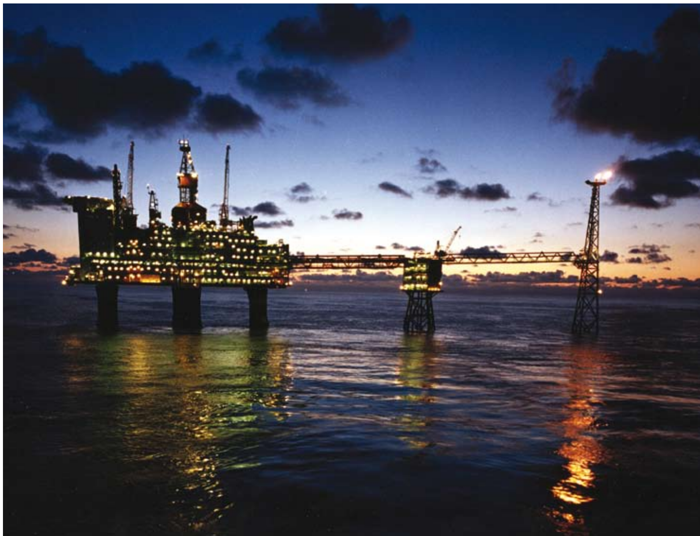
BYVIND HAGEN, STATOIL

CO 2 concentrations of 2 to 15 per cent, and high flow rates of 5 million m 3 /hr. A major problem for solvent life are combustion impurities: air pollutants such as SO x , NO x , particulates, and HCl, HF, mercury, and organic and inorganic contaminants. Consequently, commercial solvents contain cocktails of inhibitors and additives. Large fluid flows are also required, and solvent regeneration requires heating to 100–140°C, followed by compression to pipeline pressures of 100 bar. This all typically results in a 20 to 30 per cent increase in coal consumption at the plant.