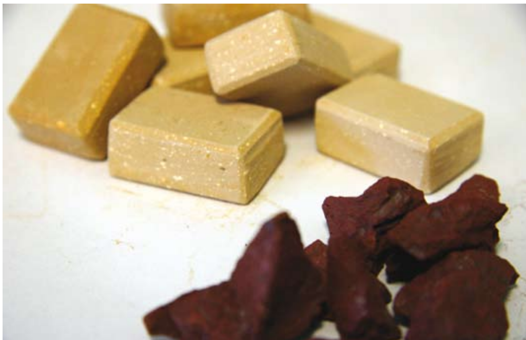
CICCS, UNIVERSITY OF NOTTINGHAM, UK

A third method of capture is currently only in the demonstration phase. Burning fossil fuels in nearly-pure oxygen (so-called oxyfuel processes) eliminates atmospheric nitrogen from the process. This not only improves efficiency, it also produces a cleaner stream of carbon dioxide. Oxyfuel burners could be retrofitted to existing coal power plants (redesigned turbines are required for gas-fired plants), and the aspiration is to provide a cost-effective low CO 2 option. The critical cost step here is to obtain cheap and reliable O 2 . Pure oxygen is normally produced by liquefying air, processes that are well-established but relatively expensive. Cheaper options could be provided by mixed metal oxide membranes with perovskite or brownmillerite structure, which allow only oxygen to pass through. These are being