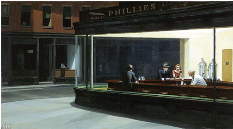
Figure 4 Nighthawks . Edward Hopper (1942). Oil on canvas.

outside and intensifying the painting's communication of loneliness. Nowhere is this more effective than in the darkness behind the couple at the counter, which sits uneasily with the restaurant's bland cream interior and its glaring lighting. Hopper scholar Robert Hobbs contends that it is the use of light that is responsible for the mood of the entire scene: