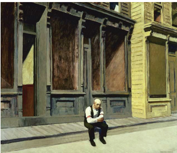
Figure 3 Sunday . Edward Hopper (1926). Oil on canvas.

Hopper's Sunday (1926) provides an instructive illustration (Figure 3). It shows a solitary man in contemplative mood sitting in front of a store. Hunched forward and appearing bored and disconsolate, it is a forlorn and lonely scene which deals with themes of emptiness, isolation, and loss. Although the man is shown on a Sunday, his day of rest, the store behind him is empty, lacking window displays or any other suggestion that it is ever open for business. We are left wondering if this is the storeowner, his livelihood in tatters, who is living his life in perpetual Sunday, reflecting on his losses and worrying about what to do next. While the painting predates the Depression, it is a