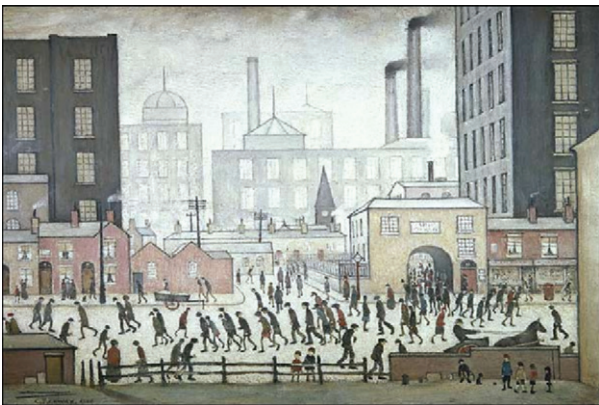
Figure 2 Coming from the Mill . L. S. Lowry (1930). Reproduced with permission of the Salford Museum.

For example, in the United States, a negative discourse of the city, which began with the pastoral musings of Thomas Jefferson and was furthered significantly by the transcendental contemplations of Ralph Waldo Emerson, grew stronger and became embedded in social life through powerful representations of urban malaise in late-nineteenth- and early-twentieth-century American literature, art, and social theory. Far from being celebrated as signs of industrial and economic progress, American cities were often viewed as dirty and disease-ridden arenas of degenerate, immoral, and corrupt behavior, the exact and unruly opposites of small-town and rural America, and therefore places which middle-class Americans would be wise to avoid for their own well-being. Raymond Williams' The Country and the City , a magisterial survey of the dialectical tensions between the country and the city in English literary representations, reminds us that the celebration of the rural in contrast to the castigation of the urban is not something confined to America, and through centuries of celebrated poetry, fiction, and philosophy this contrast has become